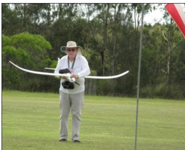
Could this 'ring-in' be Gil? Or, the star of "Grumpy Old Men".