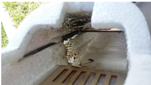
Photo shows the result when your esc is not of sufficient amps for the power output.