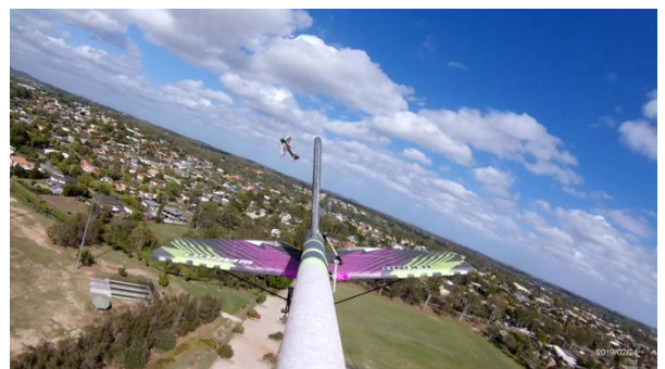
Various field shots