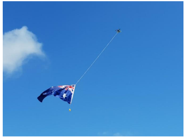
Patriotic Flag Flying by guess who?