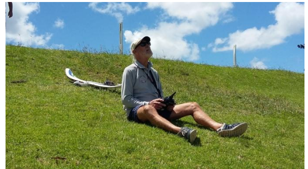
I don't believe it! Sitting down on the job