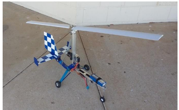
Russell's 97% home built Gyrocopter had a ground test today. Stay tuned work in progress.