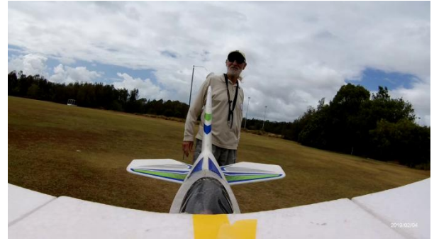
Camera in the tail