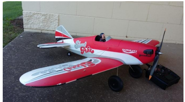
Ron's new sexy Russian Red Slow Poke had its maiden today. Perfect day, perfect flight. Looks like the Slow Poke has become the go to fashion accessory at RAM's of late, with three in the stable so far and more to follow.