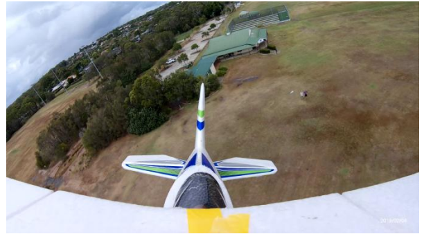
Our very dried out field taken before the recent rain