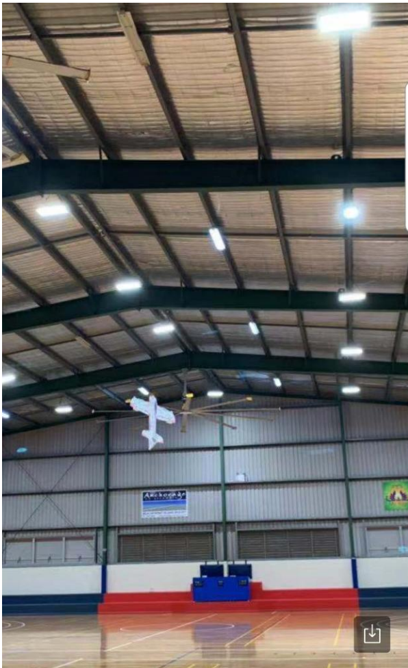
Phil's F14 Tomcat 12 bladed 80mm EDF Jet. Wingspan 1016mm retracted and 1550mm extended. Weight without battery 4160g