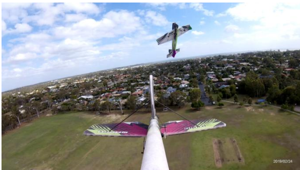
3D planes in 33 knot winds caused by cyclone Oma