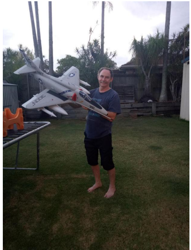
Cal's Birthday present