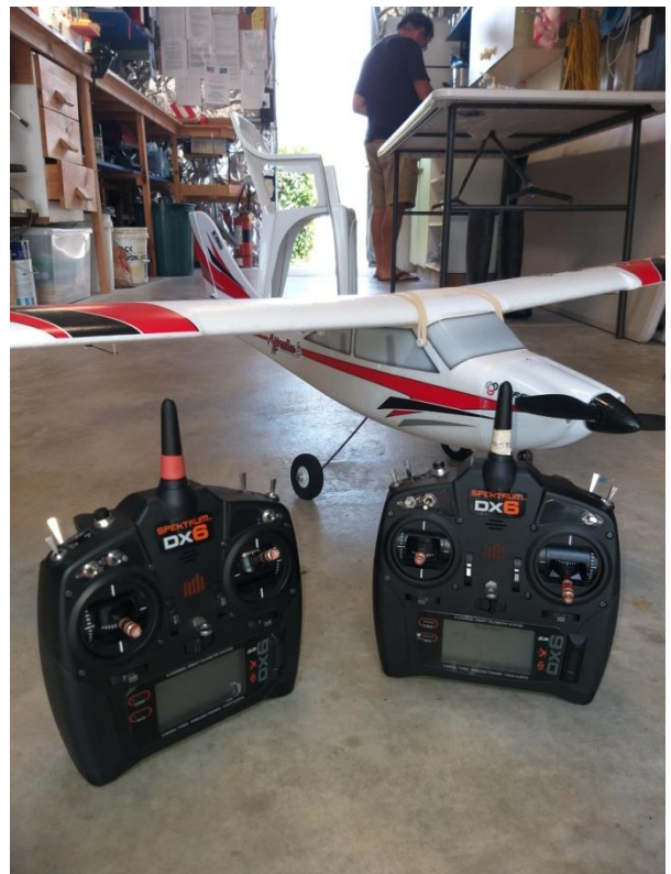
The club's newly acquired E-fliteApprentice STS giving a perfect training system.