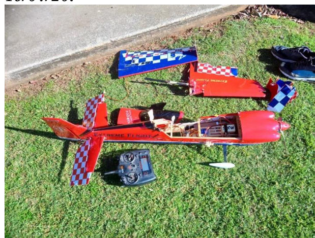
Photo shows the result of a probable elevator fail and subsequent crash into the black swamp and a tree. The excellent good news is that Phill successfully passed