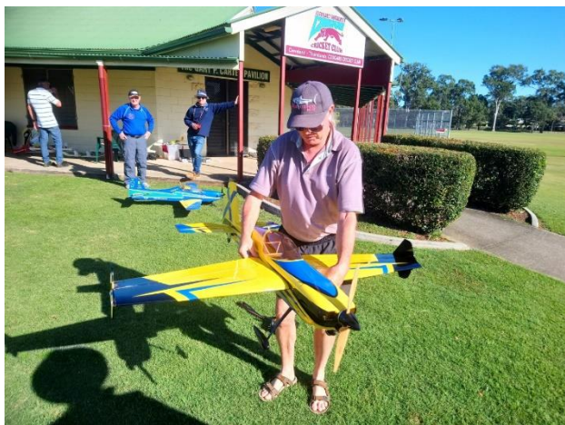
Russell's latest acquisition a SLICK 580 EXP.